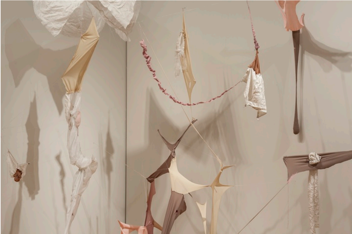
Camilla Pérez, Figure 2 (detail), 2012