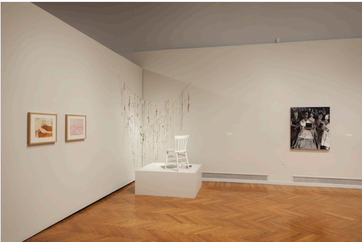
Installation view of Mona Ram's work.