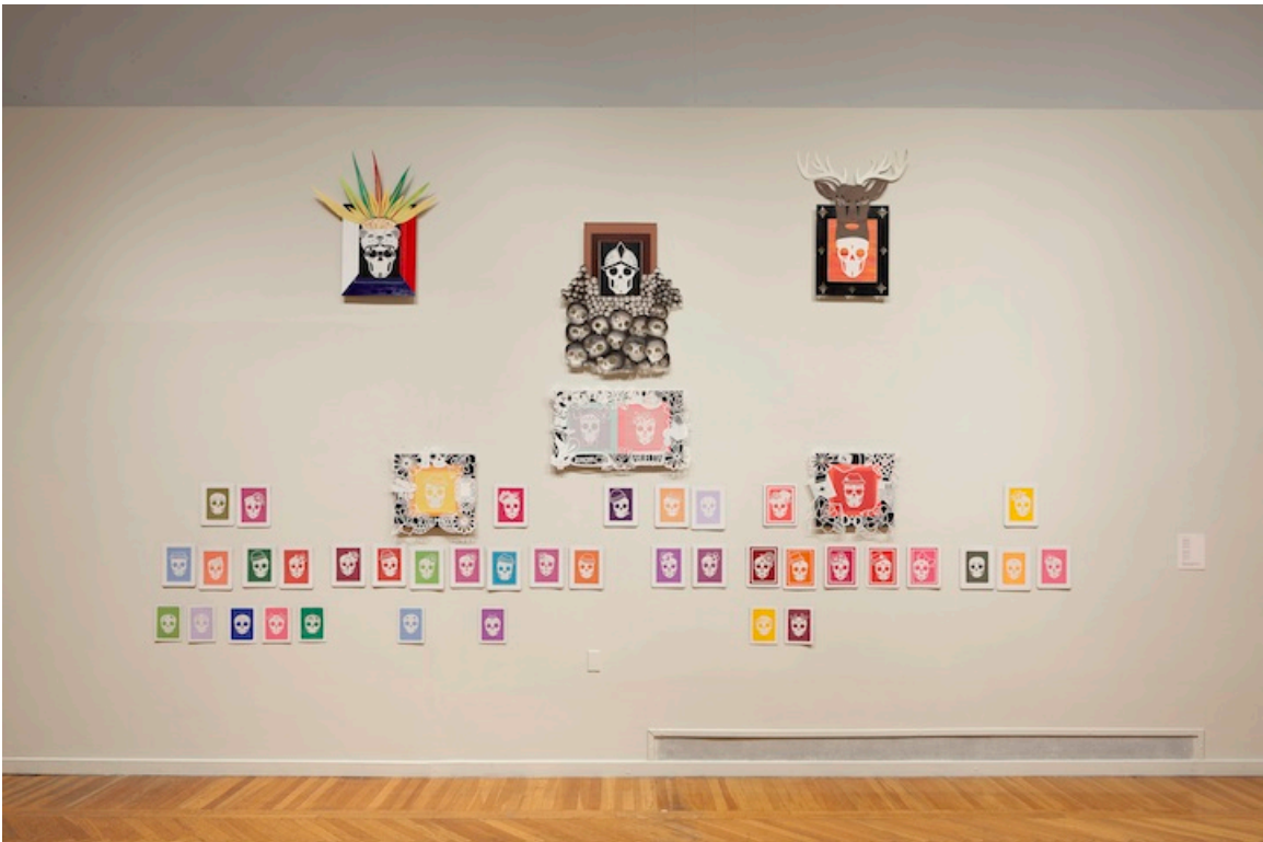
Rosita Favela, Ancestors , 2012