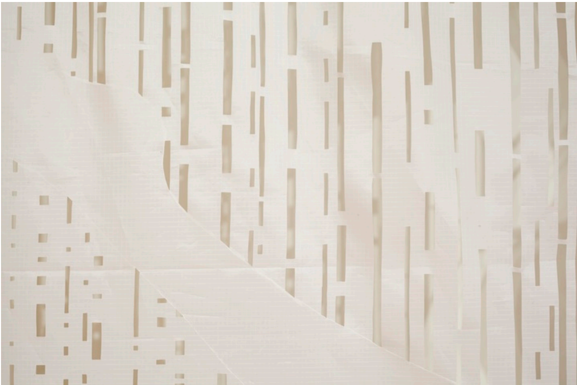
Mathilda Lazelle Moore, Aligned (detail), 2012