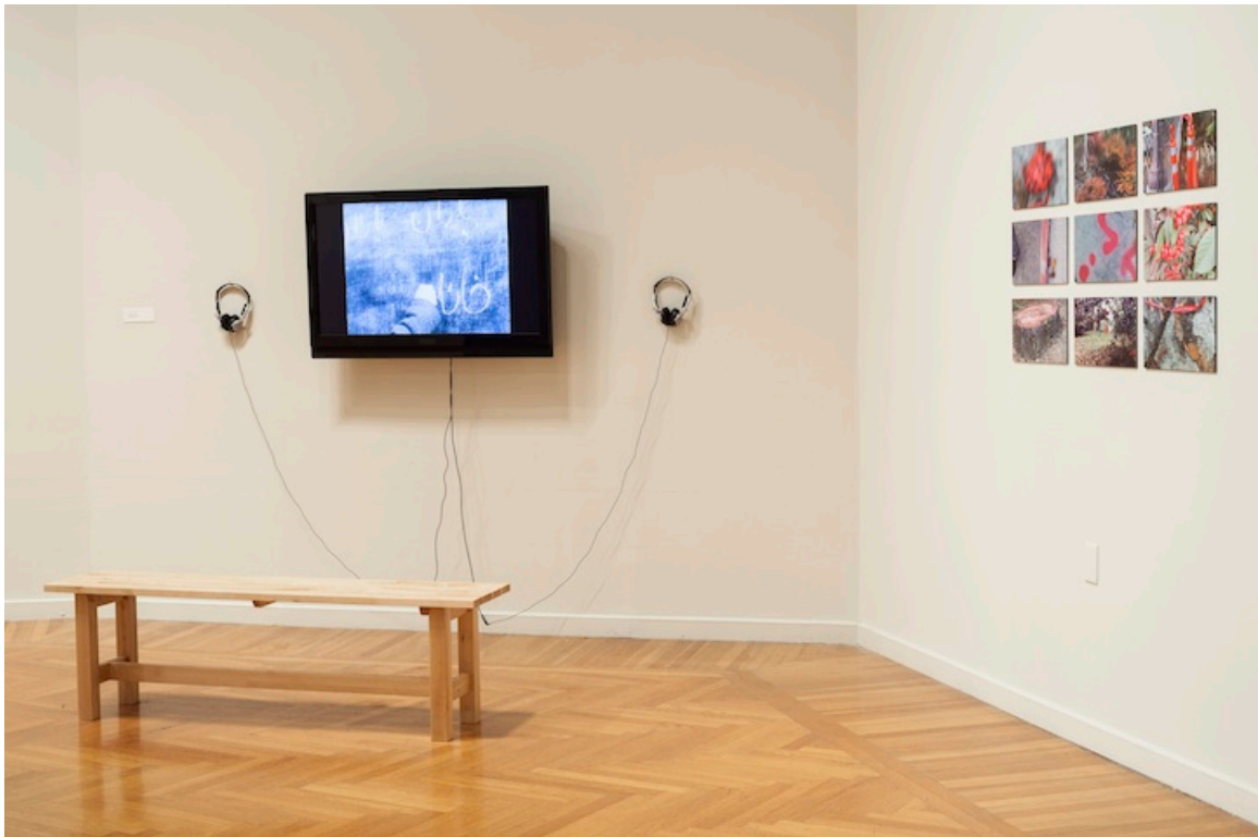
Larissa Canney, 100,000 Songs (video installation) and Taste of Cherry (Abbas Kiarostami), 2012