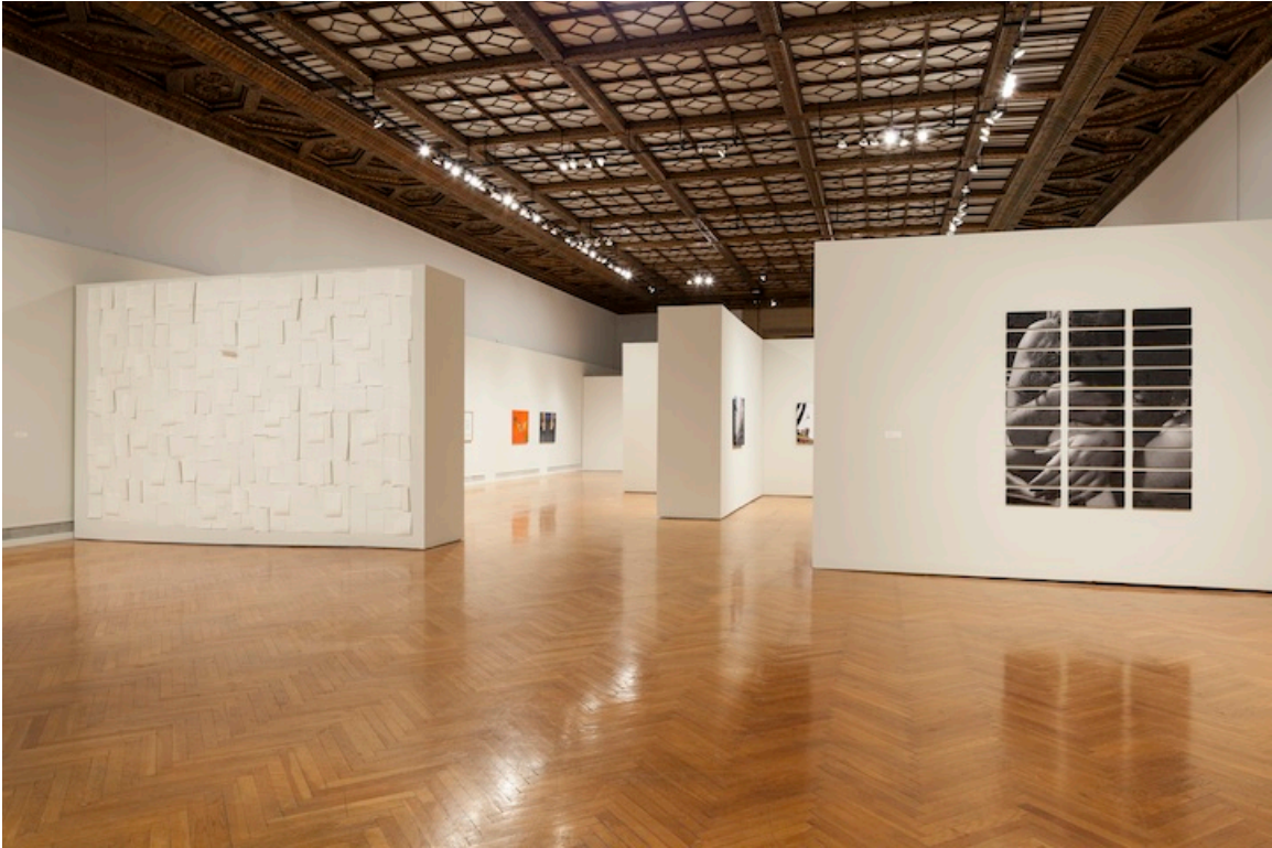
Installation view of Adrienne Suzio's work.